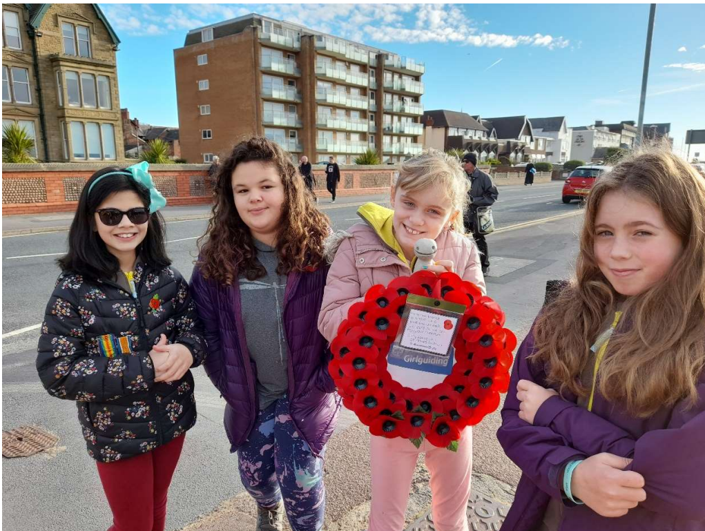
Photograph with parental permission