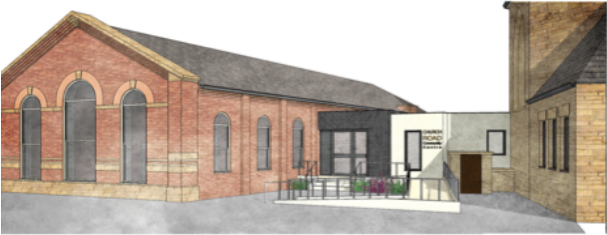
Proposed Ramp Design to New Church Centre

People have been asking how is the development progressing is it still going ahead?