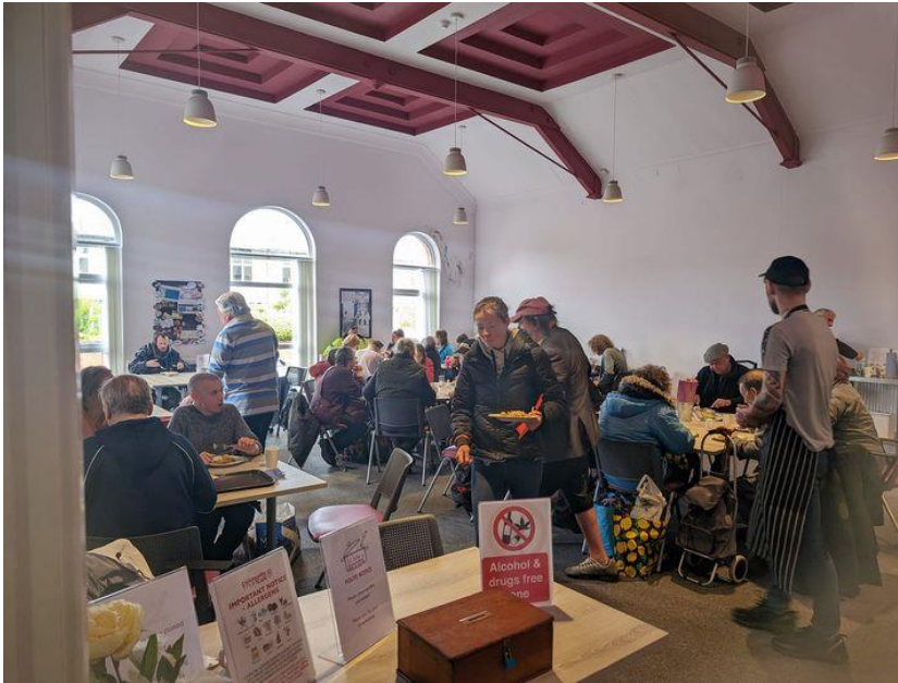
A busy morning in Wesley's

WESLEY'S continues to offer support to people in need. It is a sad reflection of the times that there are more and more families coming along that need a bit of support. In one way it is good that they have found Wesley's and the help they can offer, but very sad that working people are finding that everyday living is becoming harder.